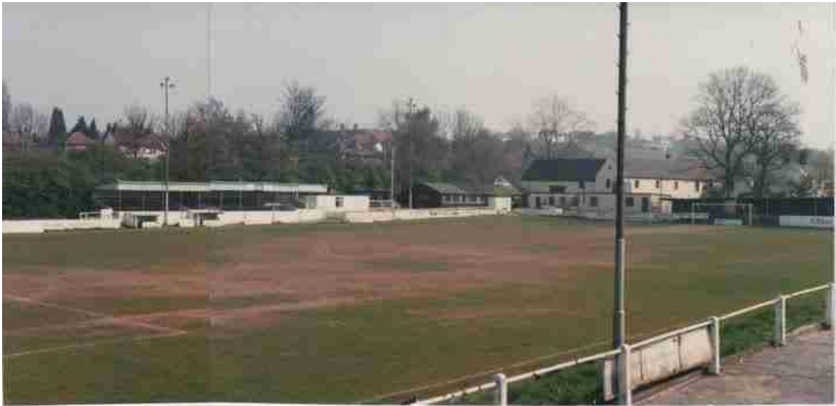
The Old Ground now under Keys Avenue

Behind one goal at the Hednesford End is a small covered seated stand, which has a capacity of 300. Although situated directly behind the goal it doesn't extend to the full width of the end, having open terracing to one side towards the Main Stand.