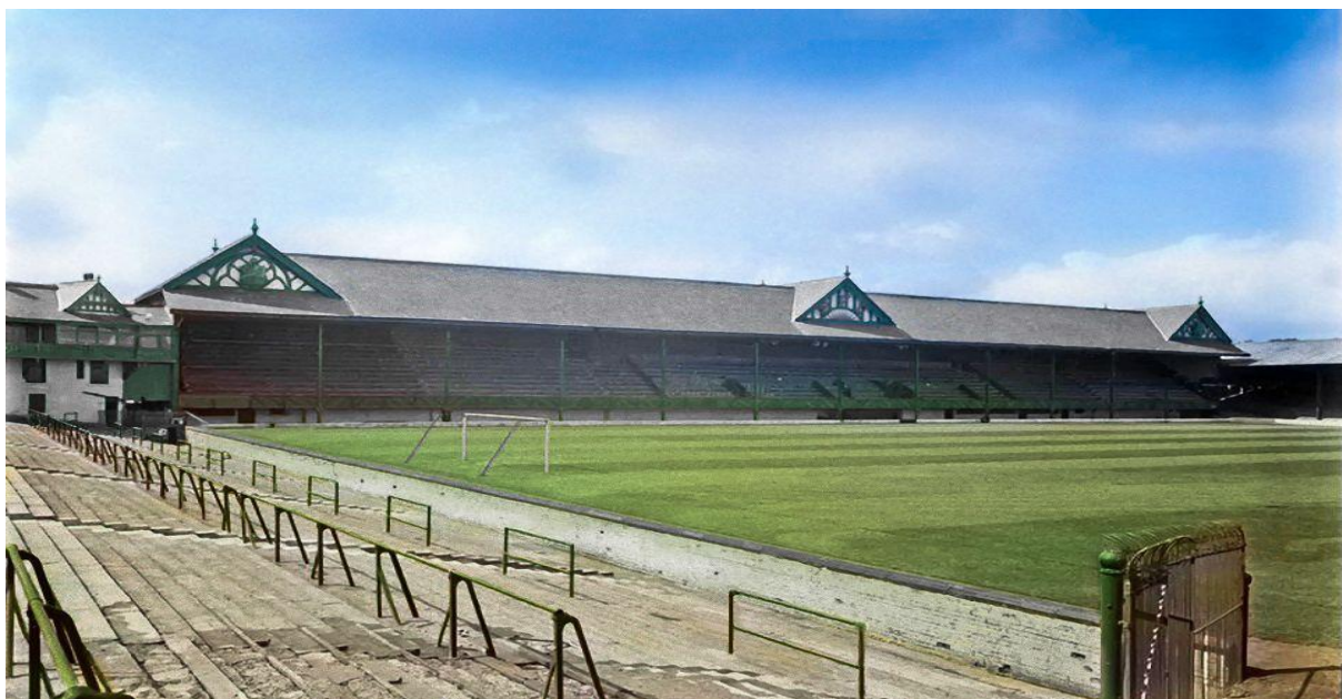
The Cricket Ground 1968

You can also take the train at Leeds Railway Station turn right and then turn left into Princess Square then first left into Wellington Road and then take second right into King Street walk up to the Hotel Bus Stop and take the First in Halifax 508 bus to Cemetery Road then turn left and the ground is on the left after 100 yards.