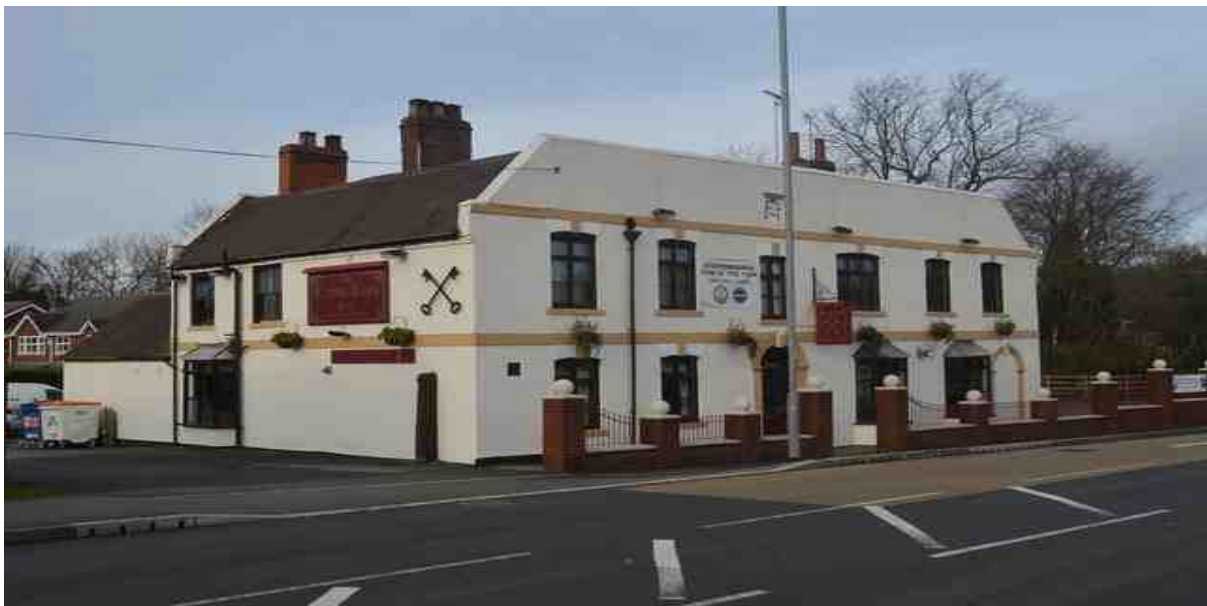
Cross Keys Hotel Public House

Train to Hednesford Rail Station then turn left and at the roundabout turn left into Railway View and at the bus stop beside Little Chimps take the Chaserider 62 bus to Kingsmead School then walk back and turn left into Hill Street on the way down nip into the Cross Keys bar, then walk down to the keys roundabout take a left and then cross the road and take a right into Pitman Avenue the ground is at the bottom of the road