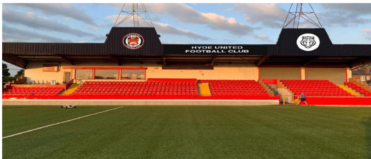
Main Stand and Scratching Shed

On one side of the Main Stand is a small old covered terrace, affectionately known as the Scratching Shed, whilst the other side is unused. Opposite is another new looking stand called the Leigh Street Stand, this small covered terrace runs almost the full length of the pitch and is where the team dugouts are located. At one end is the Walker Lane End, which is another small covered terrace. Opposite is the intriguingly named Tinkers Passage End.