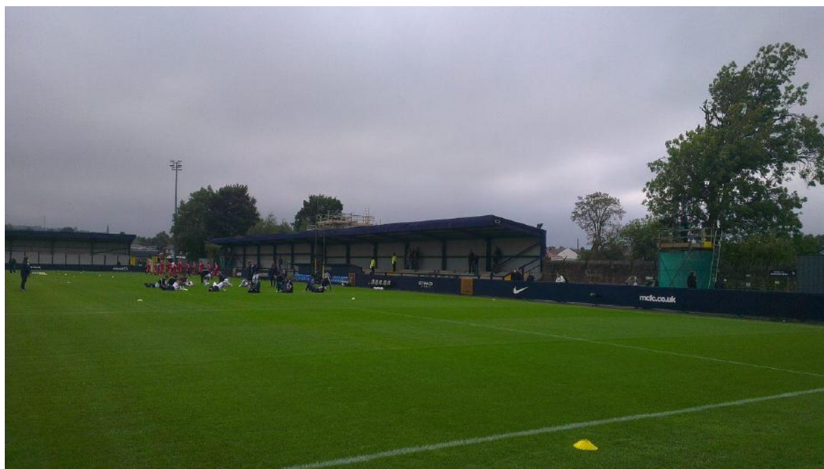
Tinkers Passage End

Travel down the M1/A1 to Junction 42 take the M62 to Manchester & Bradford then at junction 20, take the A627 (M) exit to Rochdale/Oldham, at the roundabout, and take the 1st exit onto A627 (M) heading to Oldham and Continue onto Broadway/A663. After two miles slight left to merge onto M60 toward Ring Rd (E & S)/Ashton-u-Lyne/ Sheffield/ Manchester Airport/ M67/M56 then at junction 24, take the A57/M67 exit to Denton/Hyde/Sheffield Leave the M67 at Junction 3 and at the traffic lights at the top of the sliproad then turn right towards Hyde Town Centre.